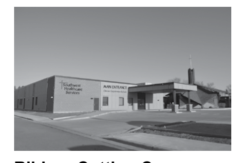
Ribbon Cutting Ceremony – May 1st Opening day for SW Medical Clinic and Outpatient Services Grand Opening Celebration (June)– to be announced

Dept. of Health plan approval "Topping Off" Celebration Certificate of Occupancy from Dept. of Health Provisional Hospital License from Dept. of Health